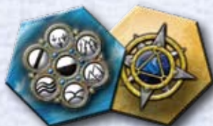
Wild Rumor Token

Each rumor token represents one of the seven terrain types (fjords, tundra, ice, snowdrifts, forests, mountains, and frozen wastes), with the exception of wild tokens, which can be used to represent any terrain type, including towns. Additionally, any rumor token terrain type may be used to represent a town space.