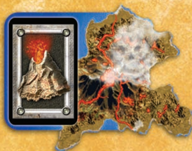
Island of Dread Deck

Follow the rules for game setup, adding the new components from The Island of Dread expansion to the play area.