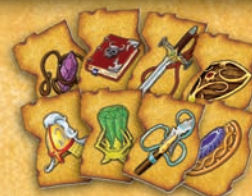
Legendary Item Counters

If you move out of a town without voyaging, you must place all Captains back onto the town's market stack. Finally, if there is more than one Captain in a town's market stack at the end of any player's turn, that player must choose one Captain to remain in the market stack and discard the rest.