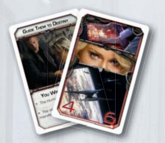
Sympathetic Agenda Cards