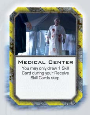
Example of a Hazardous Location

Locations with a yellow-striped border are considered hazardous. These locations include the "Brig," "Sickbay," the "Resurrection Ship," the "Medical Center," and "Detention." Players may not move to a hazardous location as part of their normal movement. They may only move to a hazardous location when a card or effect sends them to it.