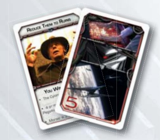
Hostile Agenda Cards

These cards are added to the Quorum deck of the core game. The President may use these cards to help augment the human's resources and fend off threats from the Cylon forces.